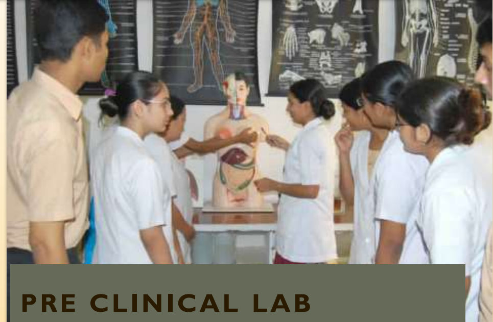
PRE CLINICAL LAB